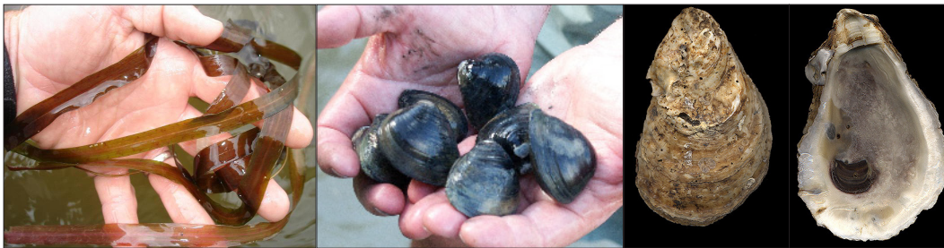
Eelgrass, Rangia clams and oysters collected from the Pontchartrain Basin for oil spill monitoring.

Research scientists from the Pontchartrain Institute for Environmental Sciences (PIES) at the University of New Orleans (UNO) primarily study the Pontchartrain Basin, a large watershed covering 10,000 square miles. The basin region is made up of many diverse ecosystems including rivers, bayous, swamps, hardwood forests and marshes that provide habitat to many species of fish, birds, mammals, reptiles and plants. One of the institute's most recent projects focused on the potential negative effects of the oil spill on eelgrass and other species of submerged aquatic vegetation (SAV), eastern oysters and Rangia clams (two local bivalves), and free swimming fish and invertebrates. Scientists also tracked the movement of oil from the spill in the basin by analyzing the water, tissue samples collected from oysters and clams, the grasses and other vegetation and sediment samples.