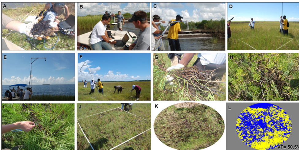
Researchers gather biophysical and geochemical data from oil impacted salt marshes in coastal Louisiana.

The specific questions researchers hope to answer include: which wetland locations are most damaged due to the spill; which salt marsh species are most vulnerable to oil exposure; what is the degree of damage and the extent of recovery in spill impacted marshes; and is there a high probability of marsh fire due to spill related grass damage or browning? The overall goal of the research is to evaluate and map the ecological impact of the oil spill on the photosynthetic activity, health and growth of coastal salt marshes.