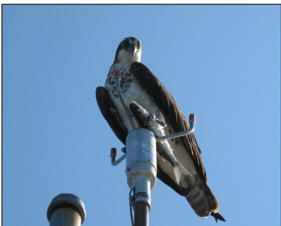
An osprey (clutching his next meal) is dependent on the water for its source of food and therefore can be impacted by poor water quality.

Early results of this study show the amount of oil in the tested waters to be small. This relatively low amount of oil appears to have had minimal impacts on the water quality. One of the most influential events of the oil spill appears to be the opening of the Davis Pond and other fresh water diversions. This was done across Louisiana to prevent oil from entering the sensitive estuaries. The surge of fresh water had significant effects on salinity and water quality in the Barataria estuary. Another component of Turner's oil spill study, the assessment of changes in the microbial community, is still being reviewed. The impact of the oil on microbes is of great importance as they are a vital component of the marine food web. This study, as well as others from the Northern Gulf Institute, has highlighted the importance of long-term ecosystem monitoring. LSU's fifteen-year data collection has allowed them to compare data collected after the oil spill to samples obtained long before the spill.