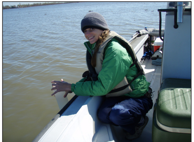
A researcher collects a water sample to assess water quality in Breton Sound, LA.