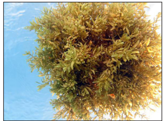
A clump of sargassum floats in the clear blue waters of the Gulf of Mexico.

While seaweed may be viewed as nothing more than a smelly nuisance by many beach-goers and sunbathers, it provides important habitat and food for marine life. Sargassum , also known as “gulf weed,” provides critical nursery habitat for many species of fish, crabs, shrimp and other invertebrates, as well as endangered sea turtles. Some of the fish seeking shelter amongst the brown algae include larval and juvenile tuna, dolphin fish (mahi mahi), wahoo, and several species of billfish. The floating algae provides the young with shelter from predators and also food. Later, some of the same fish will return to the sargassum as adults looking for small fish to feed on.